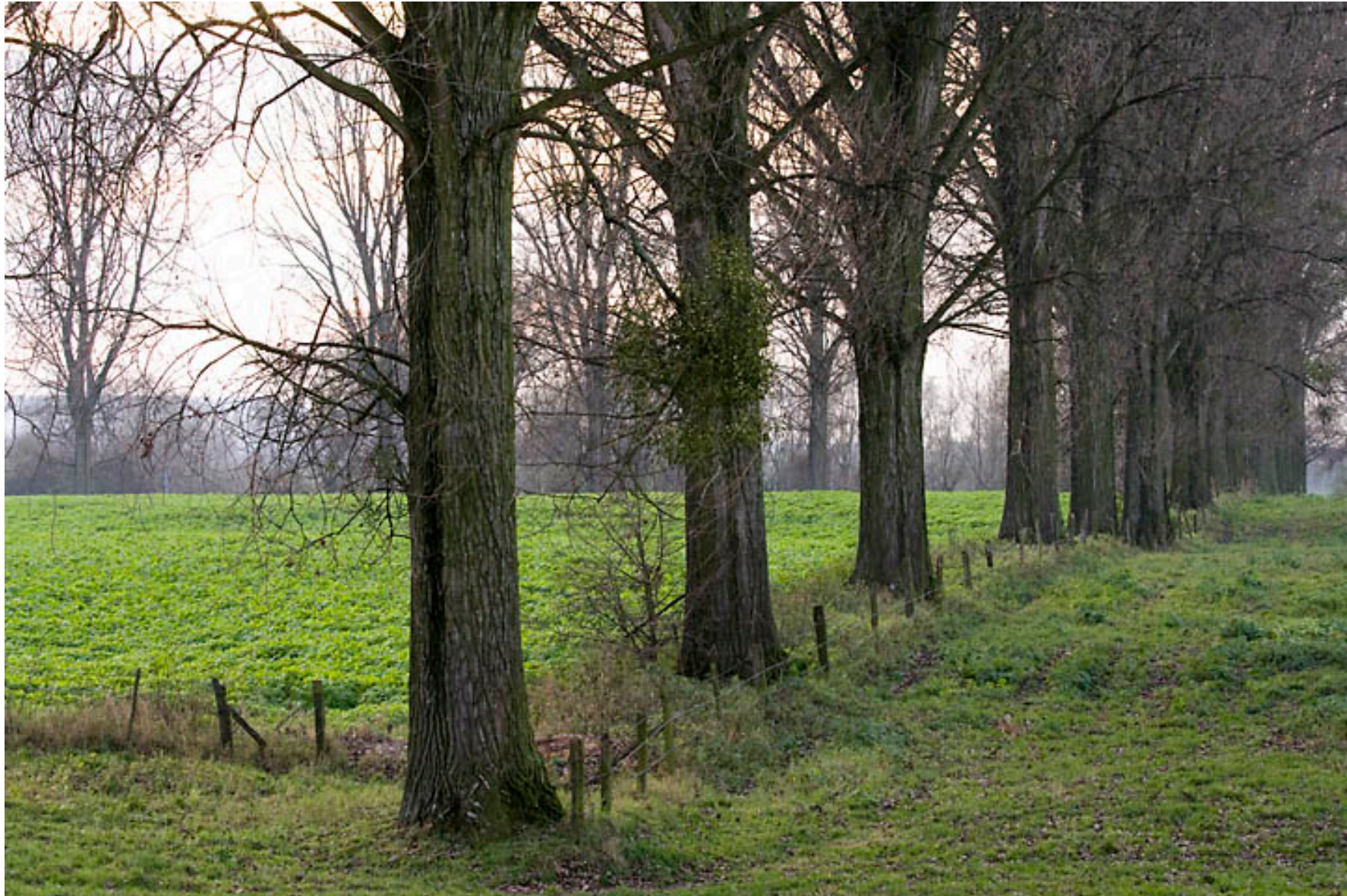
Rhine flood plains at Himmelgeist